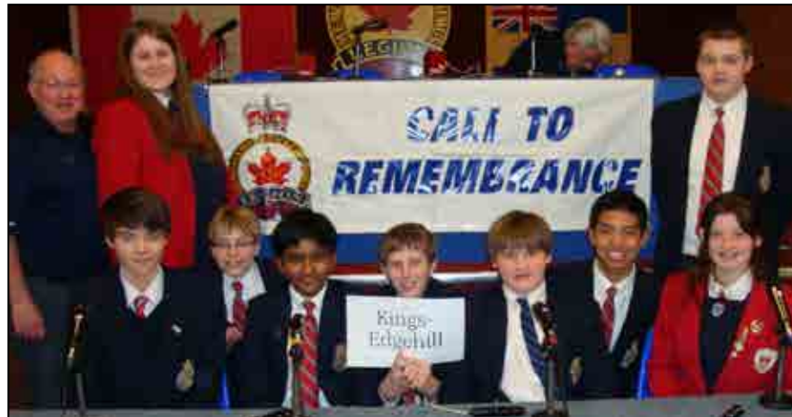
The Nova Scotia/Nunavut Command Zones 8 and 9 Call To Remembrance Quiz was contested at The Royal Canadian Legion Branch 98 in Kingston on February 7. The above photo shows the winning team from King's-Edinburgh in Windsor after their win.