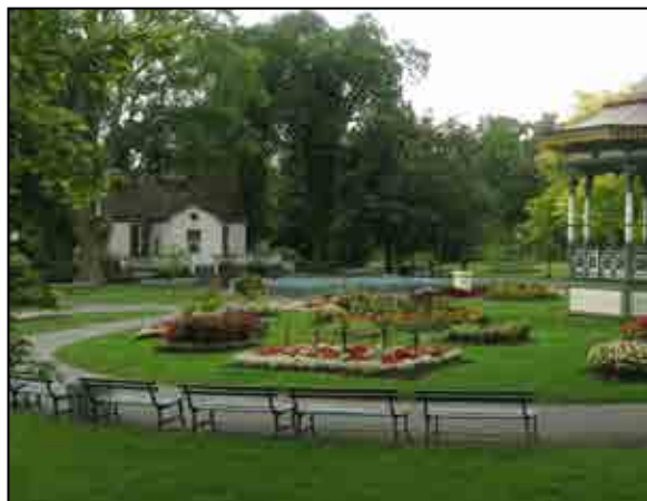
Benches and Bandstand.