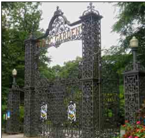
Halifax Public Gardens, Main Gate.