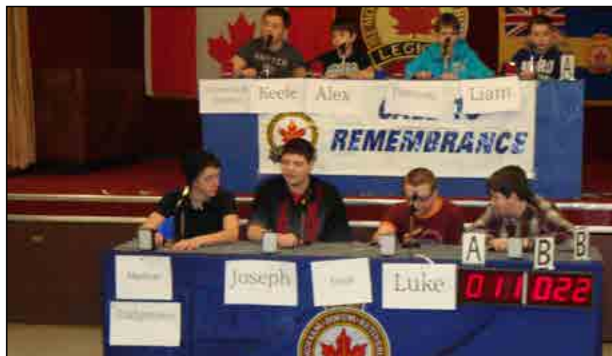
Above, Bridgetown (Zone 9) and Berwick (Zone 8) are shown during the Zone 8 and 9 Call To Remembrance Quiz competition in Kingston on February 7.