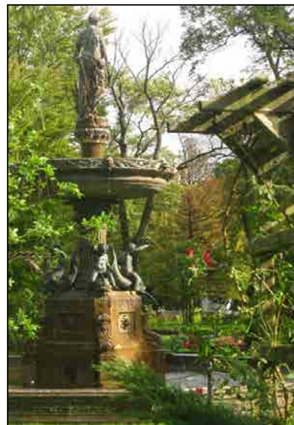
Victoria Jubilee Fountain.

Bedford Basin was the gathering spot for the ships which would travel across the Atlantic in convoy, escorted and protected by Armed Merchant Cruisers. A return journey took six weeks. The Battle of the Atlantic lasted 2073 days, the longest battle of WWII. One of those escorts was tied up for 10 days and her crew was granted shore-leave.