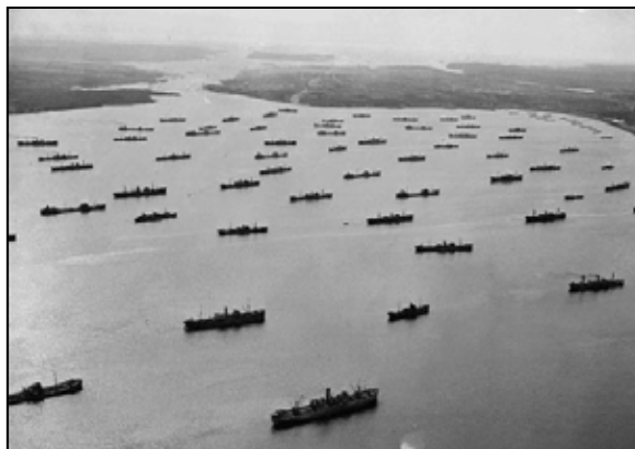
Bedford Basin Convoy 1941.

The year was 1941 and the war had been going on for two long years.