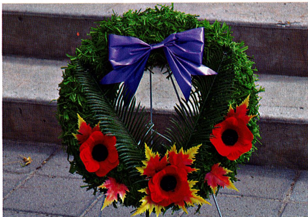
200514 - #14 Wreath