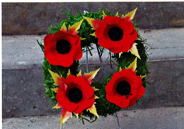
200508 - #8 Wreath