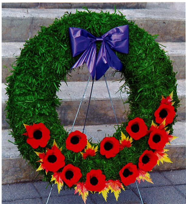
200524 - #24 Wreath