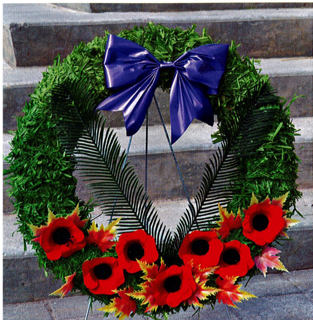
200520 - #20 Wreath