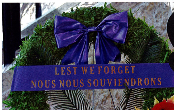
200571 - Inscription Ribbon

The placing of a memorial wreath in respect for the Fallen is a time honoured tradition. The Royal Canadian Legion offers a selection of wreaths in several sizes, as well as memorial crosses and other specialty items to suit commemorative ceremonies and services in both public and private settings.