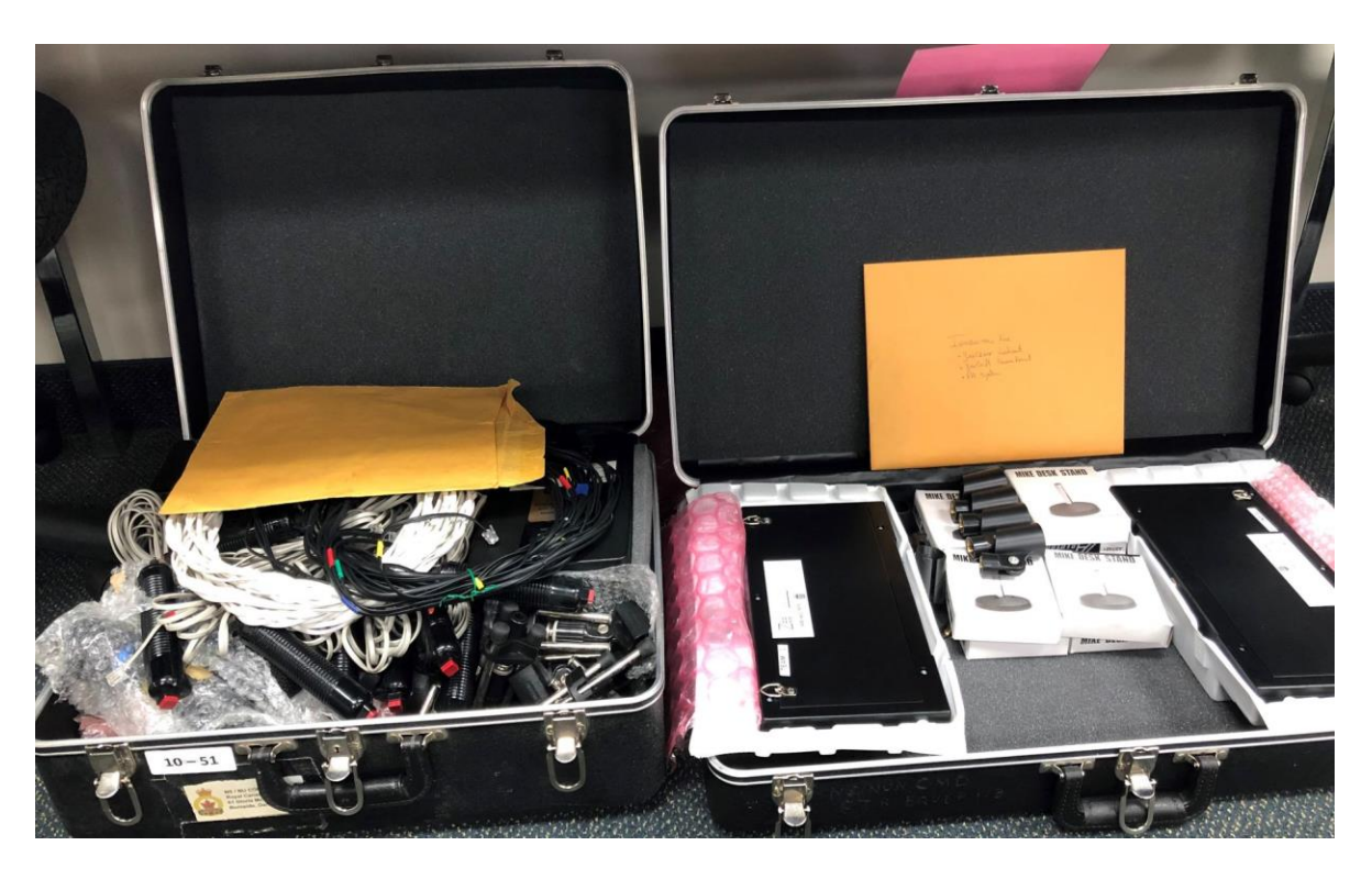
Page 2 of 2